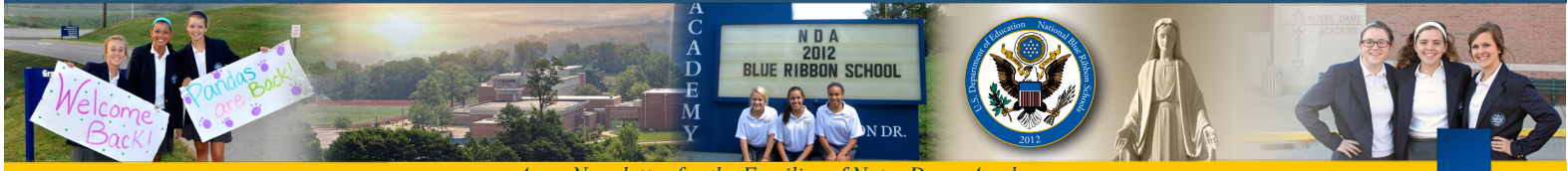
An e-Newsletter for the Families of Notre Dame Academy